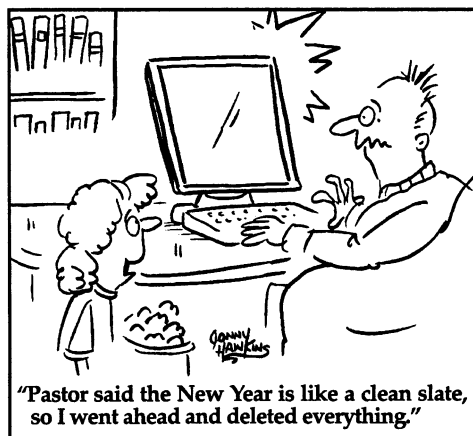
from The Joyful Noiseletter © Jonny Hawkins Reprinted with permission

The new year is full of time. As the seconds tick away, will you be tossing time out the window, or will you make every minute count?