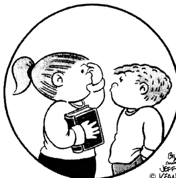
“Conscience is when God sends a text to your head.”

from JoyfulNoiseletter.com © Bil & Jeff Keane Reprinted with permission