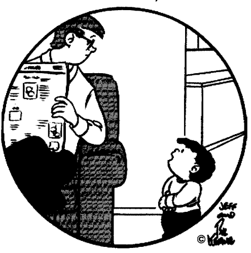
"Just so you know – if you're not doin' anything, I'm not doin' anything either."

from IoufulNoiseletter.com Reprinted with permission of Bil Keane