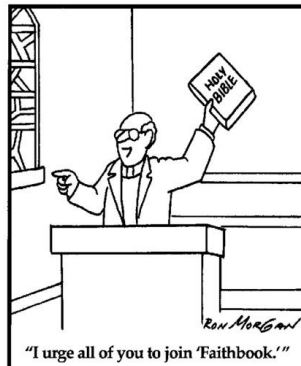
“I urge all of you to join ‘Faithbook.’”

from JoyfulNoiseletters.com